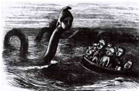
The giant sea-snake, like many that have appeared in 1848 (Illustrirte Zeitung, Leipzig, no. 287, 30 December 1848, 436)

-Theda Skocpol, States and Social Revolutions , pages 47-67 (strongly suggested: 118-128, 174-205).