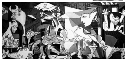
Picasso's Guernica was commissioned by the Republican government. You can visit this at Madrid's Reina Sofia. It is approximately 3 1/2 X 8 meters in size.